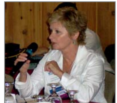
Senator Connie Lawson (IN), Chair of Women In Government's Board of Directors, asks a question during the Annual HPV & Cervical Cancer State Legislative Task Force Meeting.

These recommendations were released at the 9 th Annual Eastern Regional Conference, which was held in Lake George, NY in mid-September. The first Task Force convened in 2003 and meets annually to discuss the current cervical cancer prevention landscape update to Women In Government's HPV and cervical cancer policy recommendations. ■