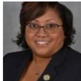
Del. Sheree Sample- Hughes (D-MD)