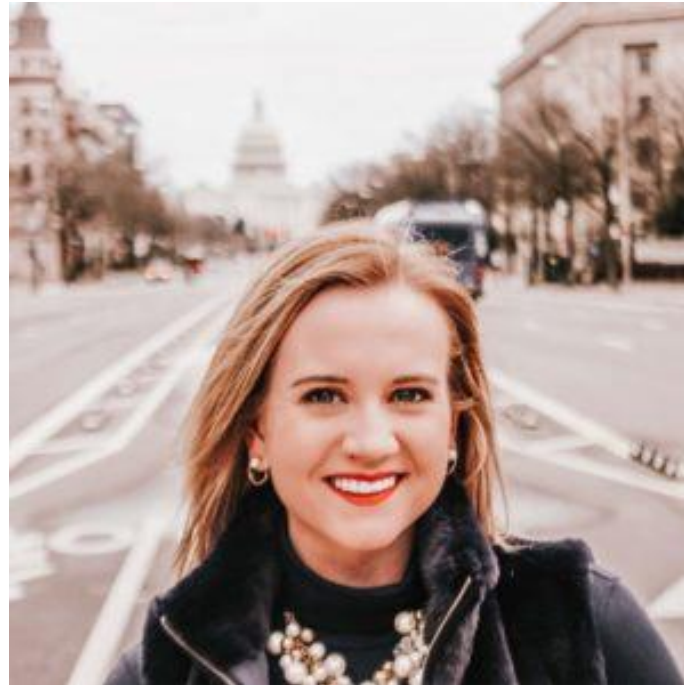
Partnership Manager Office of Congressional and Intergovernmental Affairs at the U.S. Census Bureau