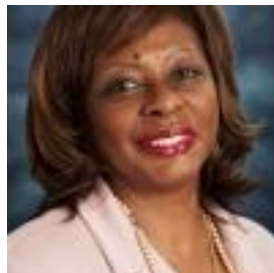
Sen. Mattie Hunter (D-IL)